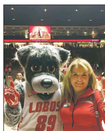
The Lobos most devoted fan (on the right!)