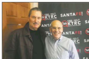
Rey interviews Mayor Alan Webber on ATRE