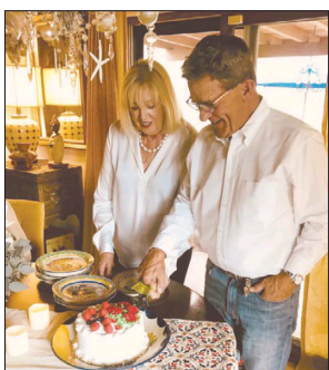
Finally, after 34 years of togetherness, a wedding